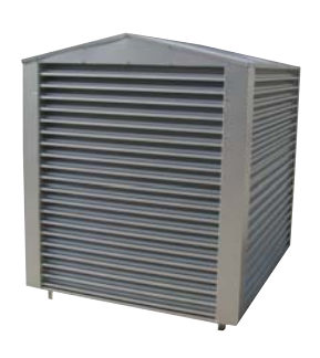
PLAB with Pitched Roof